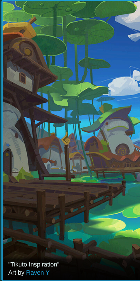
"Tikuto Inspiration" Art by Raven Y