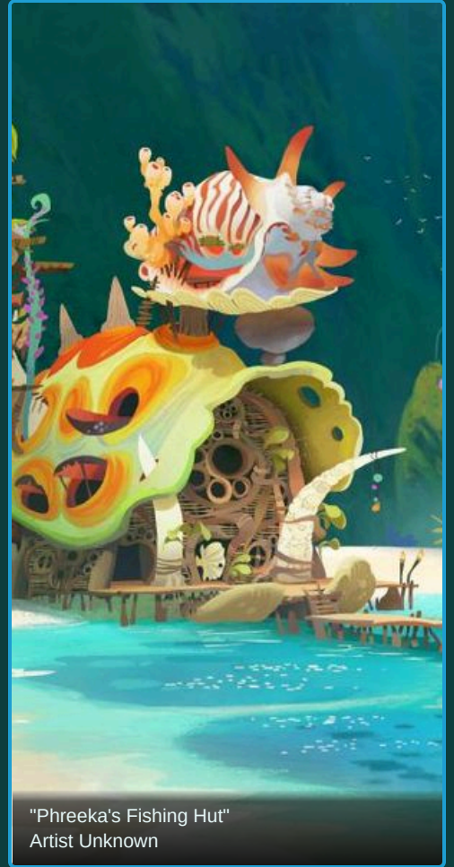
"Phreeka's Fishing Hut" Artist Unknown