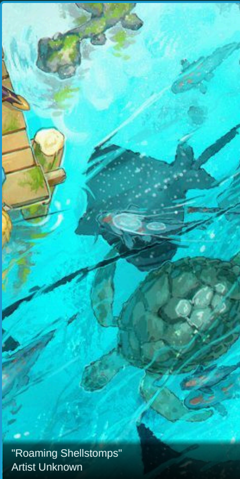
"Roaming Shellstomps" Artist Unknown